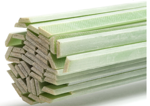
Slot wedges, trapezoid G11 epoxy glass fiber